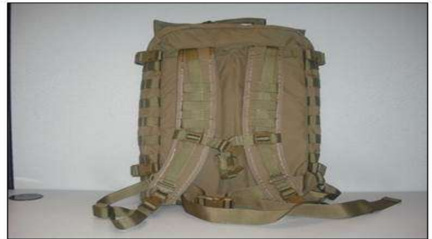
Medical Assault Pack PN: MAP- 0904 NSN: 8465-01-612-4152